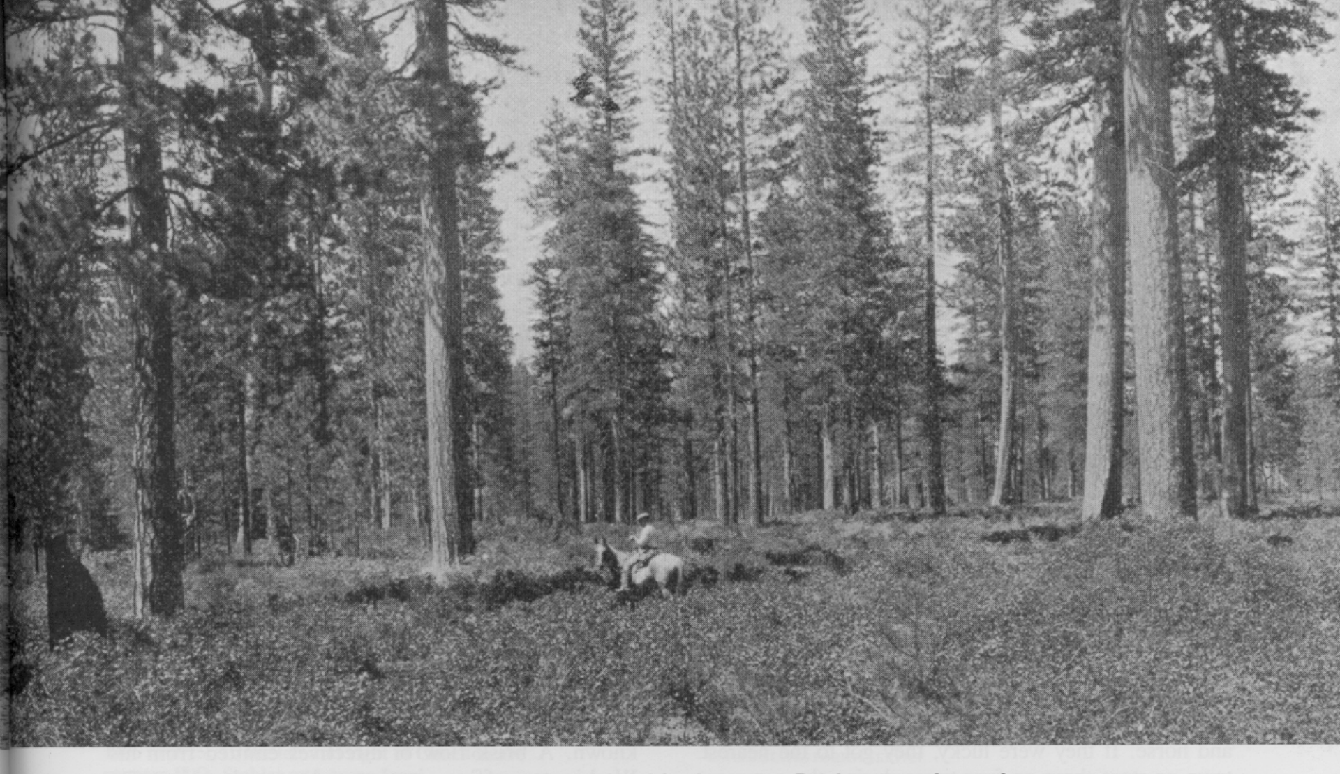
Three years later. The same range after sheep had been excluded for three years. Brush, grass and ground-cover returned. Only cattle allowed to graze. - OUT WEST, 1906