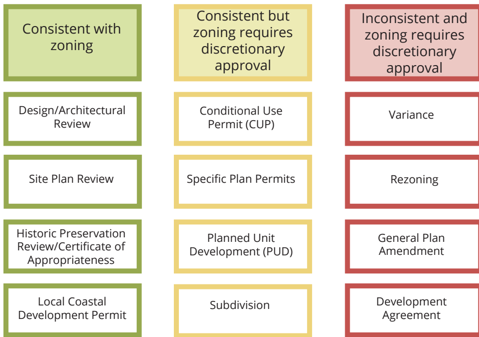
Figure 1. How Cities Can Impose Discretionary Review

When CEQA does apply to proposed development, compliance can take a range of forms and impose different levels of burden on the developer. Existing law provides local governments significant ability to shape the kinds of CEQA compliance that individual developments must satisfy, including deeming some projects exempt from CEQA, or allowing reduced environmental review.