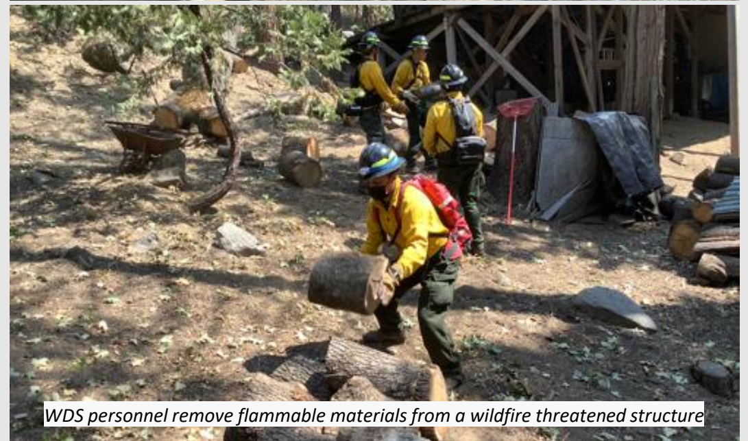
WDS personnel remove flammable materials from a wildfire threatened structure