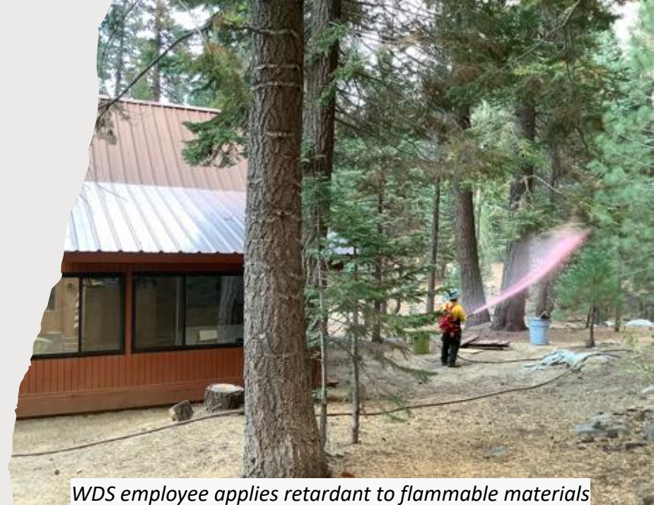
WDS employee applies retardant to flammable materials