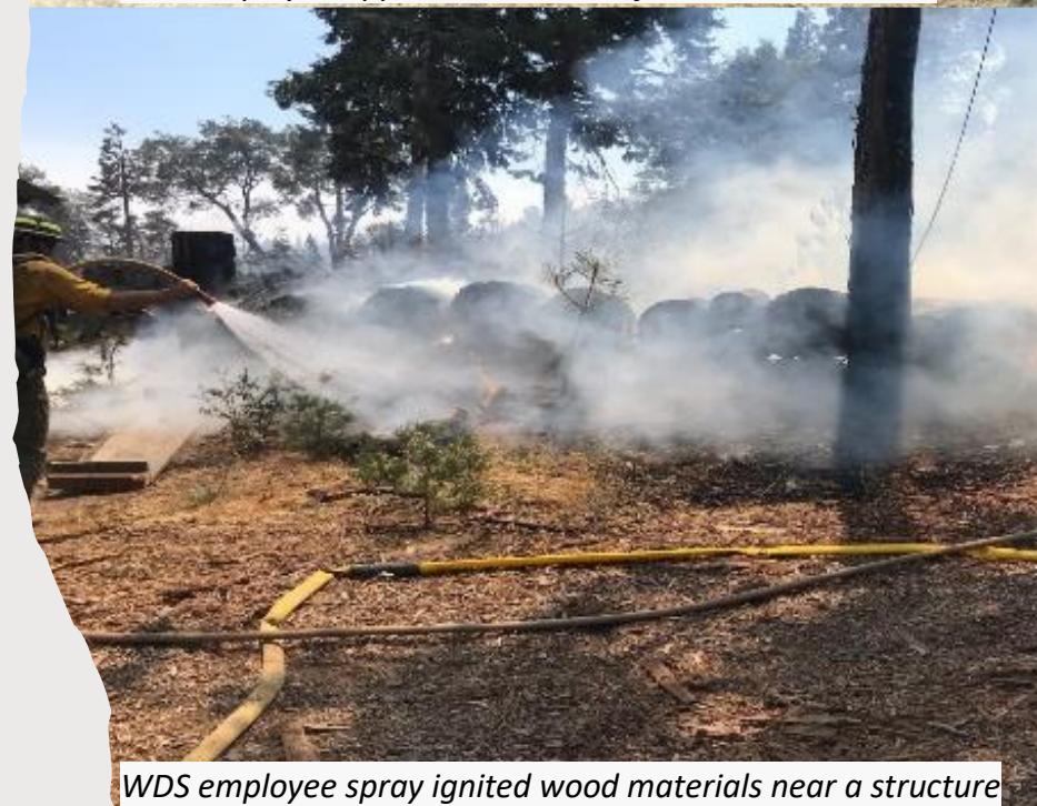
WDS employee spray ignited wood materials near a structure