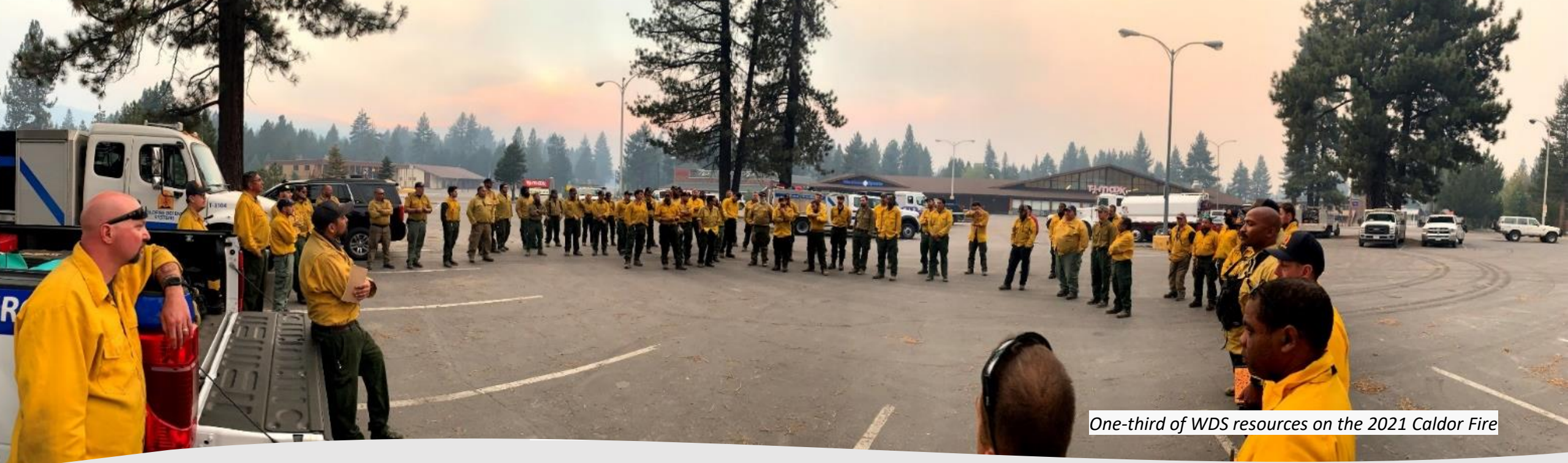
One-third of WDS resources on the 2021 Caldor Fire