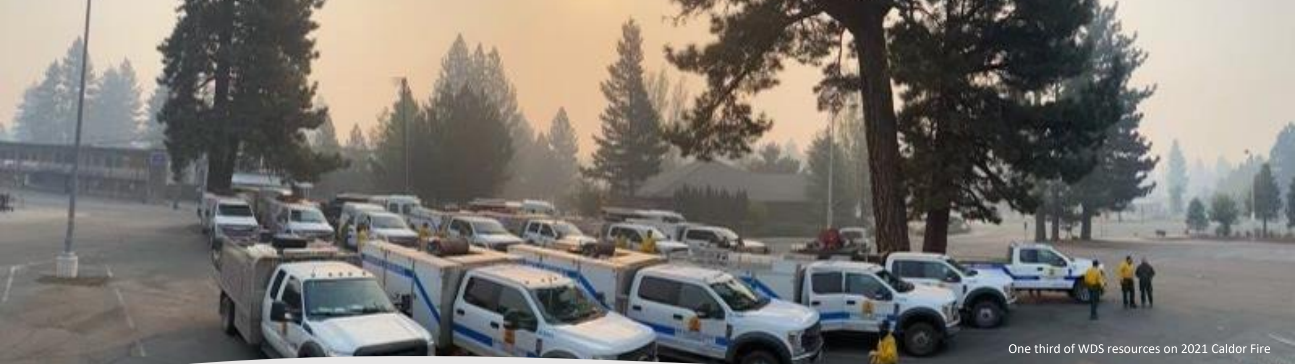
One third of WDS resources on 2021 Caldor Fire