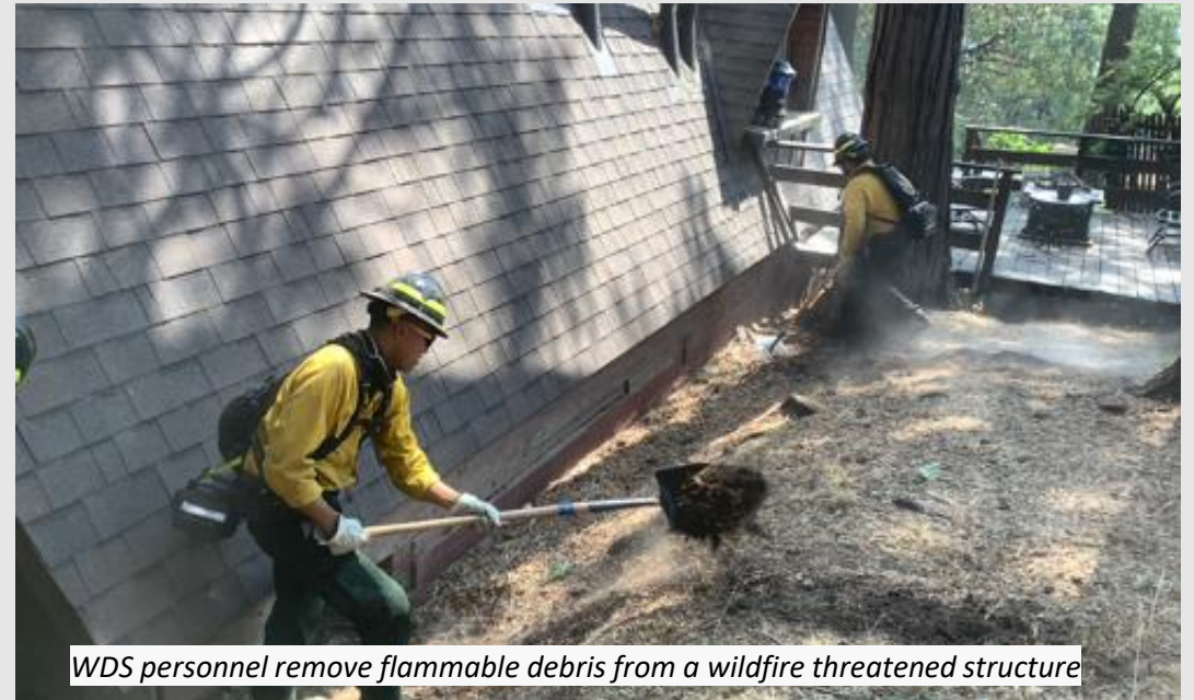
WDS personnel remove flammable debris from a wildfire threatened structure