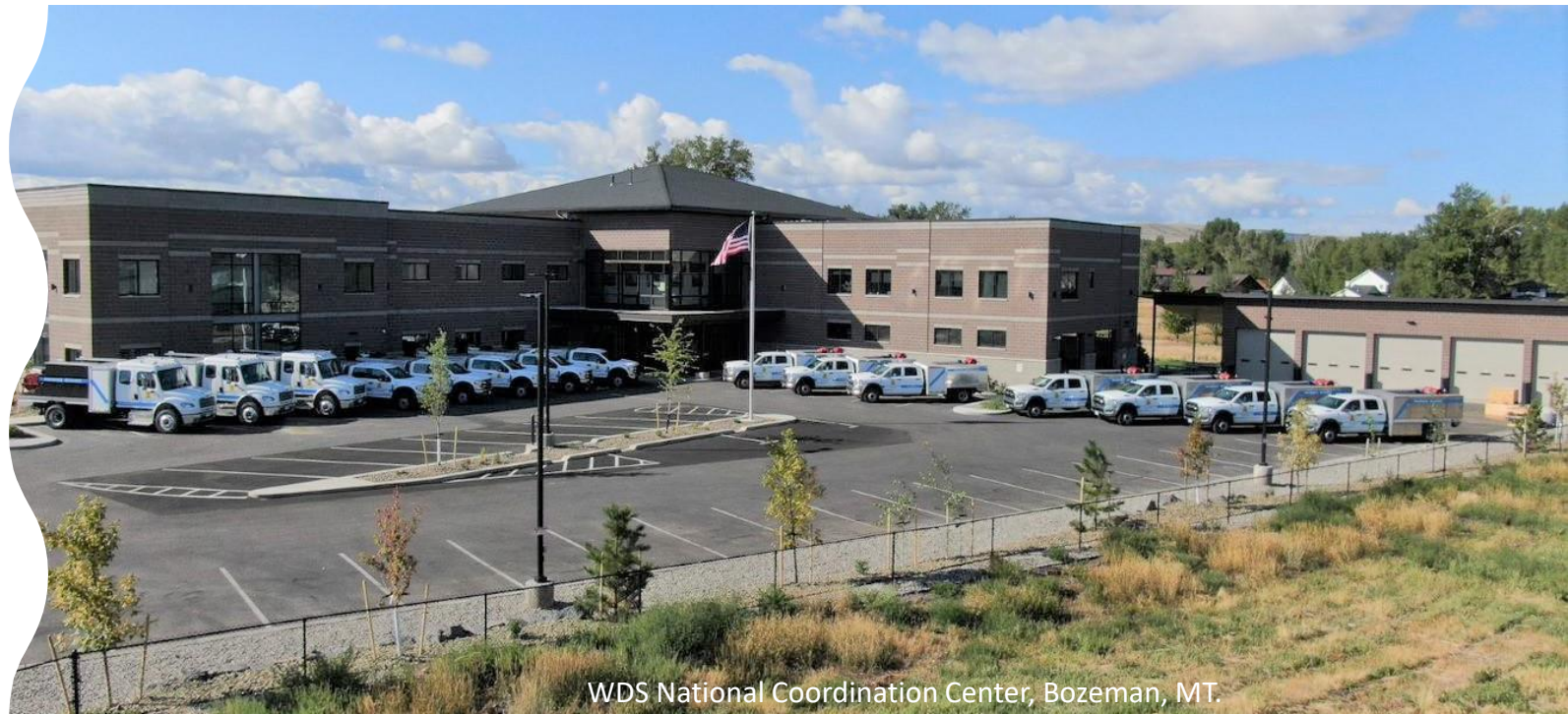
WDS National Coordination Center, Bozeman, MT.