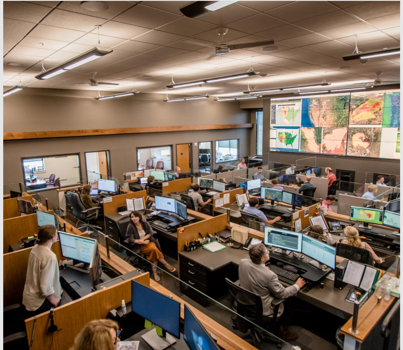
WDS Emergency Coordination Center. Bozeman, Montana