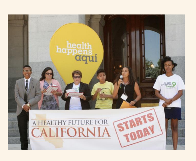
Youth & Community Leadership