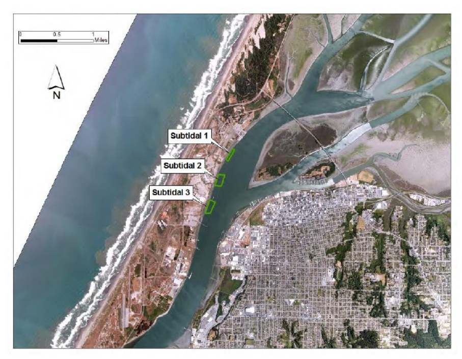
Figure 2. Recently approved sub-tidal areas that are nursery sites for seed production. Currently Hog Island Oyster Company and Taylor Shellfish utilize these sites

The six businesses that operate on Humboldt Bay represent a variety of business models, which are linked to different phases in shellfish production. Generally, the process of shellfish production as it is conducted in Humboldt Bay can be broken down into four broad phases.