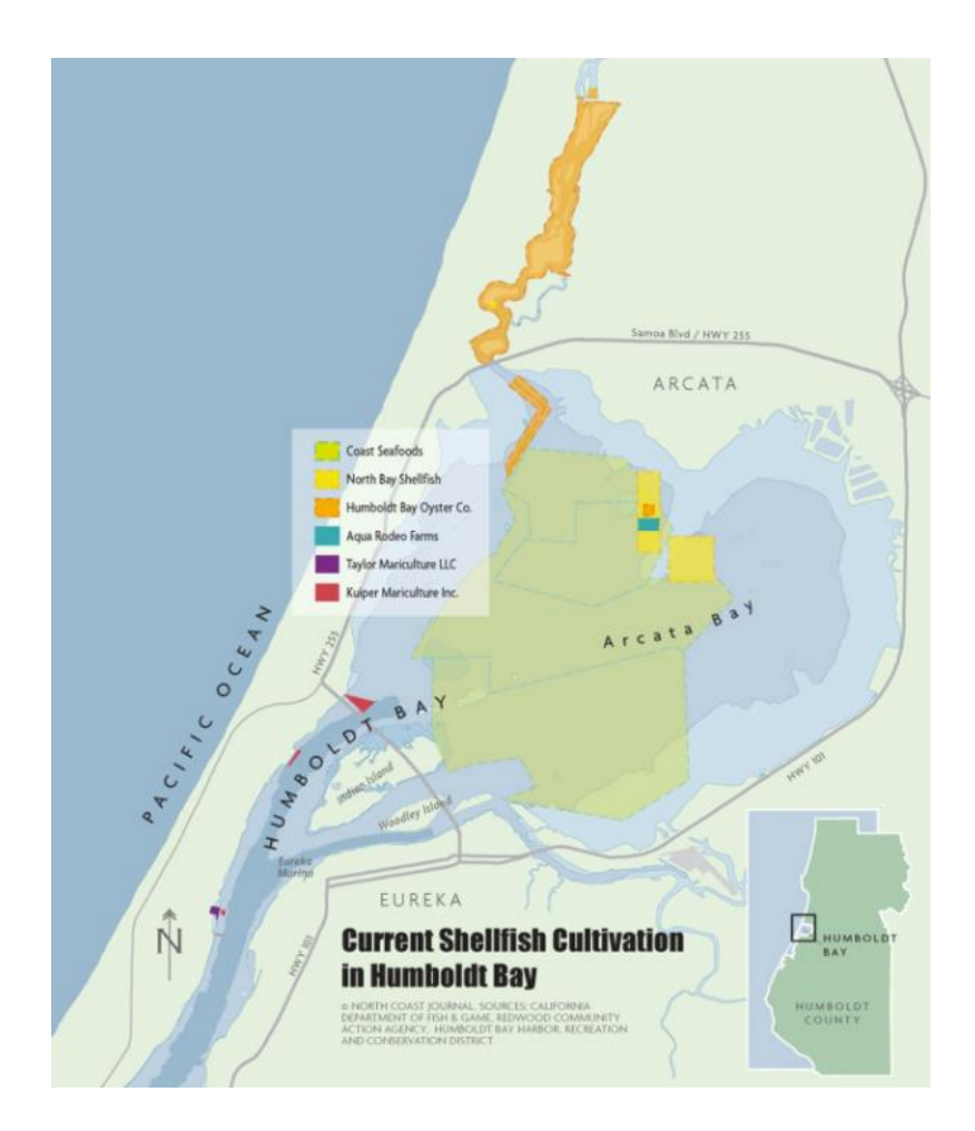
Figure 1. Map of Humboldt Bay Shellfish production areas as of 2012. The colored areas represent lease blocks and not all colored acres are under cultivation. Kuiper Mariculture Inc. was purchased by other businesses operating in the Bay.

Services, 2007). Shellfish production has been a part of Humboldt Bay since time immemorial as the Wiyot people were known to harvest and consume shellfish in the bay (Walters, 2012). Commercial shellfish sales in the bay dates back to 1854 when L.K. Wood began selling clams gathered from the bay. The first documented attempt to grow oysters in the bay was in 1897 (Coy, 1975). Currently mariculture production in Humboldt Bay includes four species: Kumamoto oysters ( Crassostrea sikamea ), Pacific oysters ( C. gigas ) and to a lesser degree Manila clams ( Tapes philippinarum ) and mussels ( Mytilus galloprovincialis ) (HBHD 2015). There are currently six different businesses operating in the Humboldt Bay shellfish mariculture sector. Maps of the locations of leased tidelands for these businesses can be found in Figures 1 and 2.