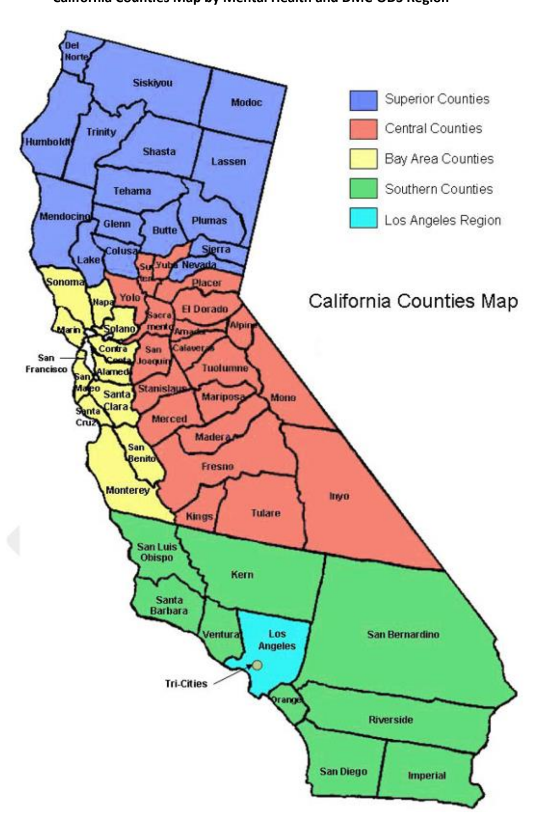
Attachment F California Counties Map by Mental Health and DMC-ODS Region