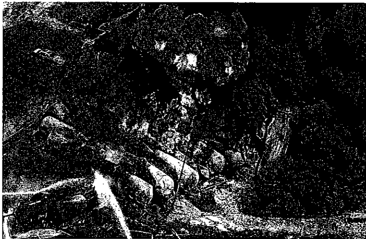
Lac-Mégantic, Quebec 14

Incidents involving crude oil from the Bakken shale formation have been particularly devastating – most notably, the tragic accident in July 2013 in Lac-Mégantic, Quebec, where 63 tank cars of crude oil exploded, killing 47 people. 13