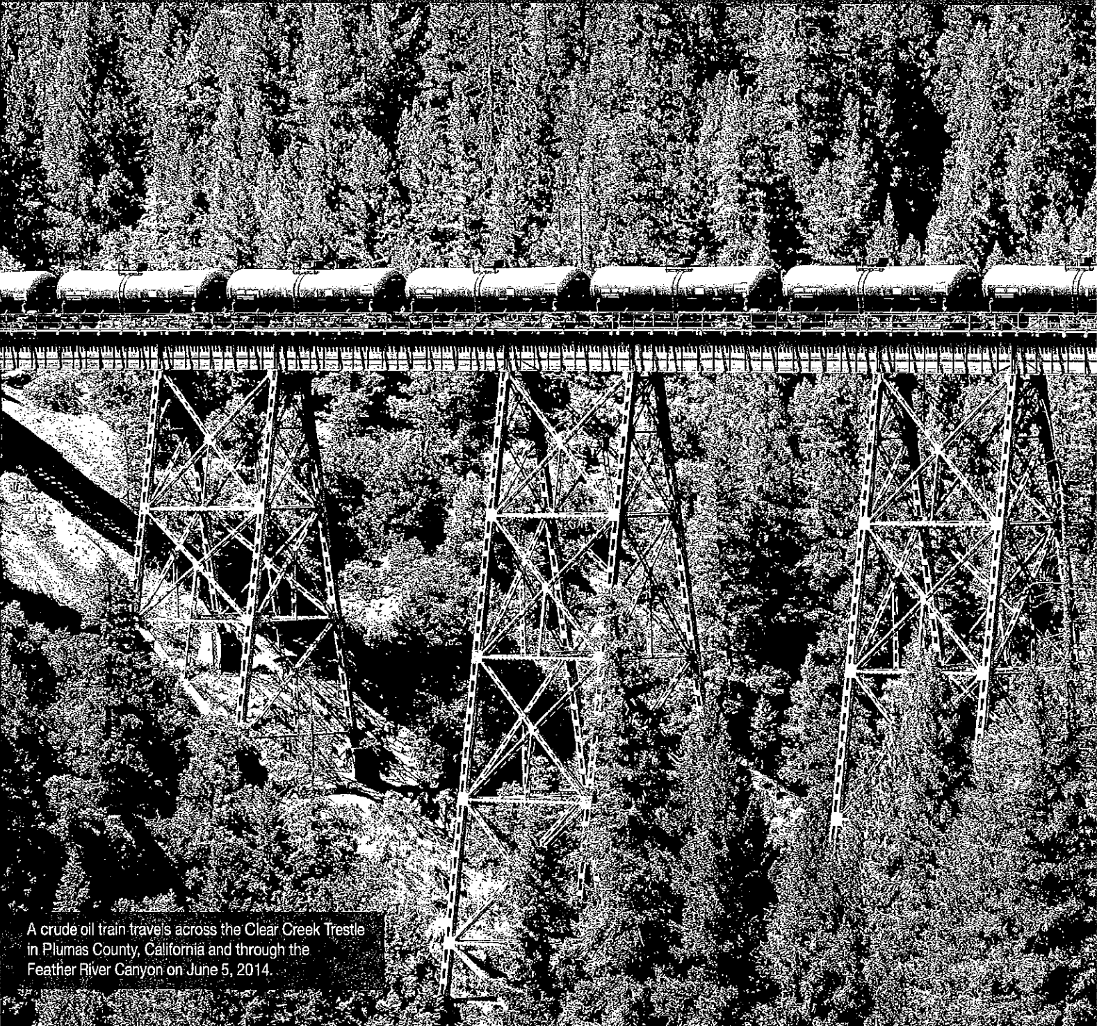
A crude oil train travels across the Clear Creek Trestle in Plumas County, California and through the Feather River Canyon on June 5, 2014.

Preliminary Findings and Recommendations