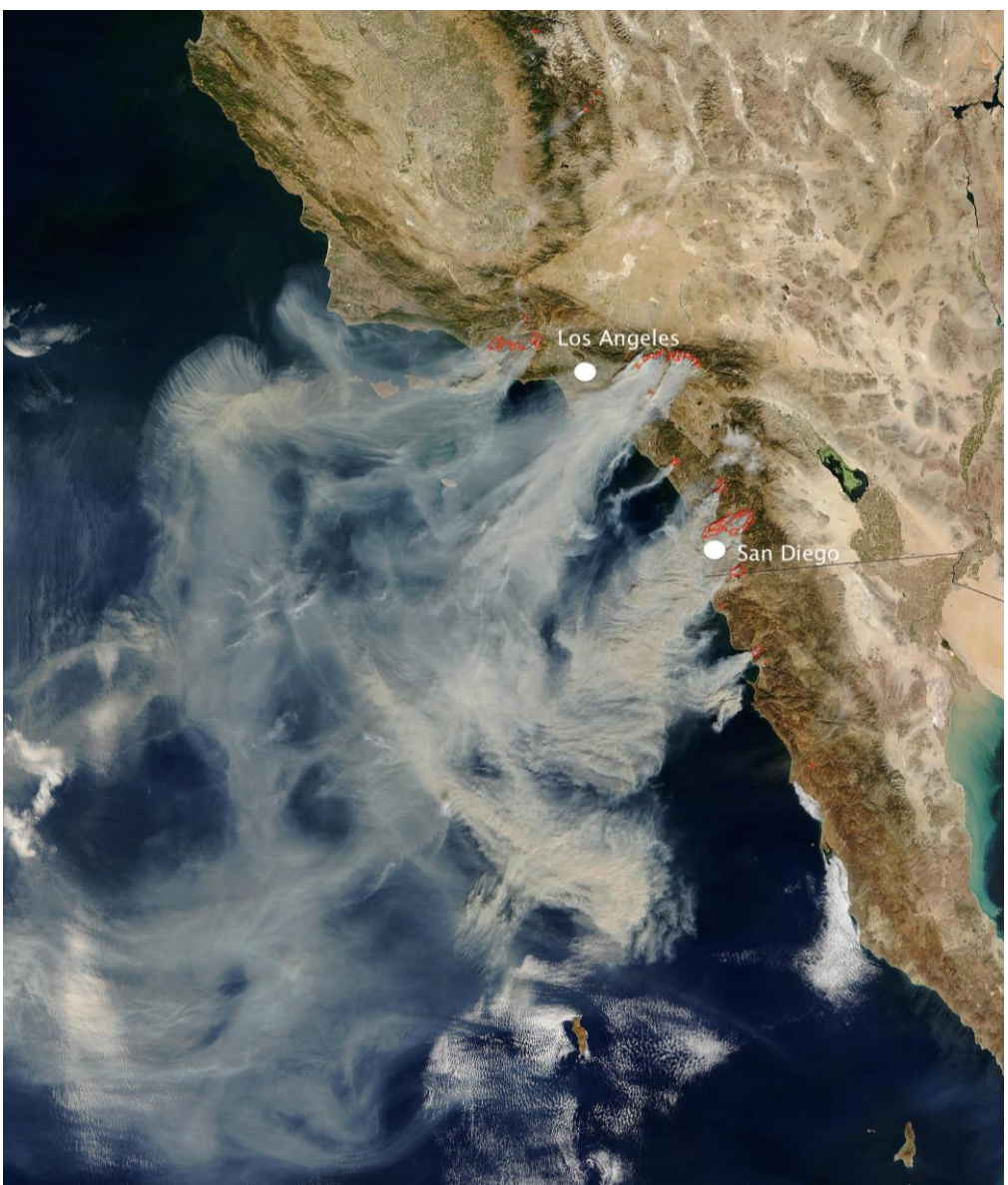
Figure 1. Wildfires and smoke plumes over Southern California on October 26, 2003.

Wildfire smoke can result in both short-term and long-term health impacts, from minor lung and eye irritation to premature death. Research on health impacts from the 2003 Southern California wildfires showed an increase in hospital admissions for respiratory problems during the fires, including asthma attacks, acute bronchitis, and chronic obstructive pulmonary disorder (COPD), with small increases in cardiovascular admissions. The research further suggested that improved prevention measures are needed to reduce illness in vulnerable populations (Delfino et al. 2009).