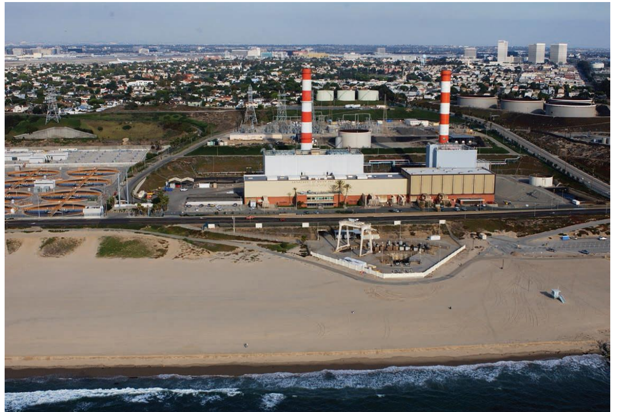
Figure 2. Image of the Hyperion Wastewater Treatment Plant and the Scattergood Generating Plant, two coastal assets in the City of Los Angeles. (Photo credit: Kenneth & Gabrielle Adelman, California Coastal Records Project, www.Californiacoastline.org). Source: Grifman et al. 2013.

These facilities are already vulnerable to flooding during storms and high tide events, and current projections estimate up to 2 feet of sea level rise by 2050 and up to 5.6 feet by 2100 (National Research Center (NRC) 2012). Climate researchers predict that storms will impact the coastline more powerfully in the future because sea level rise will raise wave run-up on beaches and storm surges, causing more erosion, as well as more frequent and extensive flooding and damages.