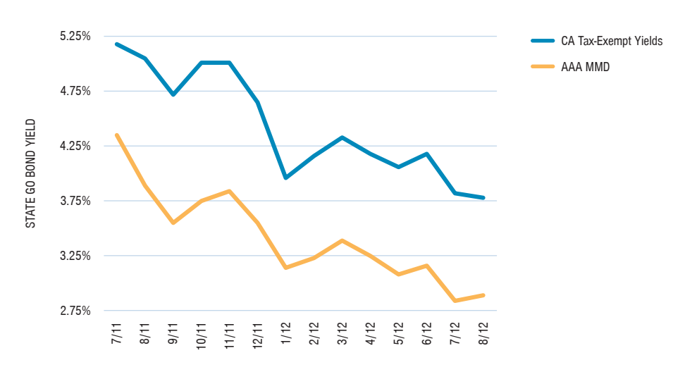
FIGURE 7 TRENDS OF CALIFORNIA GO BOND YIELDS, 30-YEAR GO BONDS