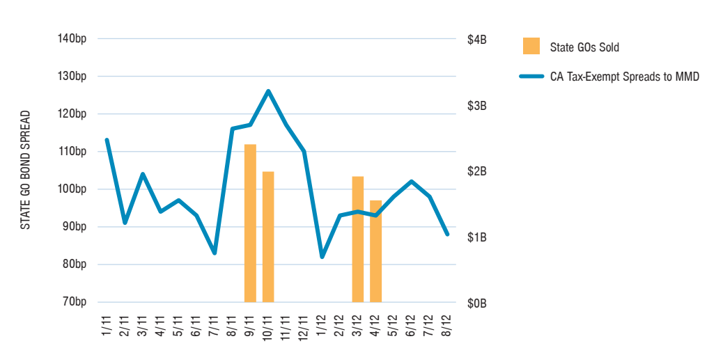
FIGURE 8 TRENDS OF CALIFORNIA GO BOND SPREADS, 30-YEAR GO BONDS