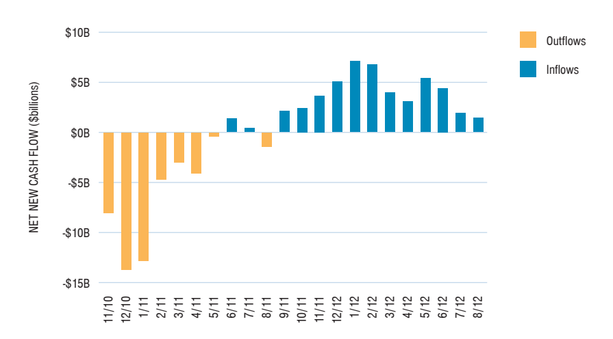
FIGURE 5 MUNICIPAL BOND MARKET, MONTHLY FUND INFLOWS/OUTFLOWS