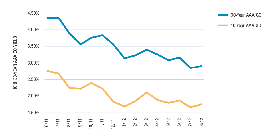
FIGURE 2 TRENDS OF TAX-EXEMPT INTEREST RATES