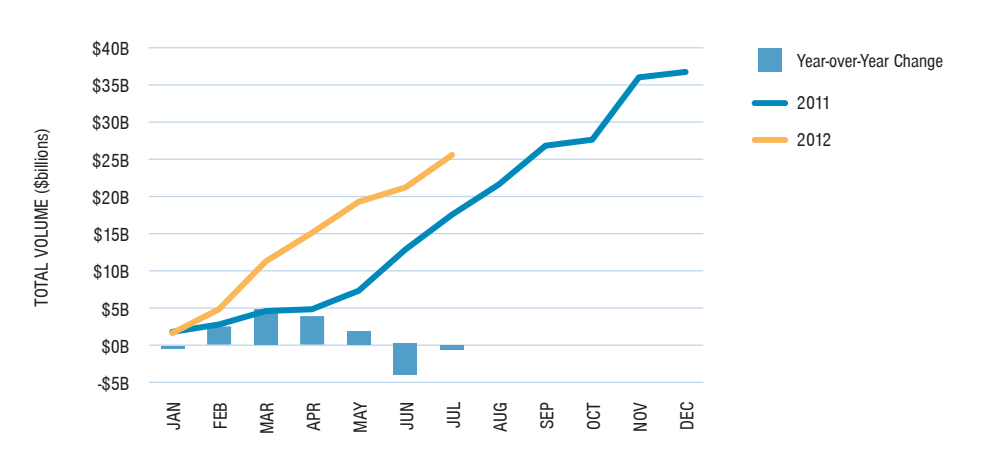
FIGURE 4 CALIFORNIA CUMULATIVE BOND VOLUME, 2011 AND YTD 2012