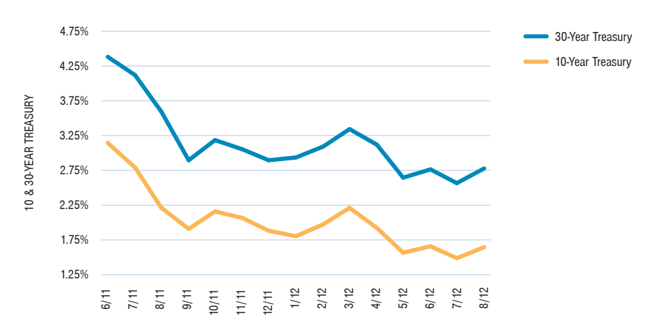
FIGURE 1 TRENDS OF TREASURY RATES