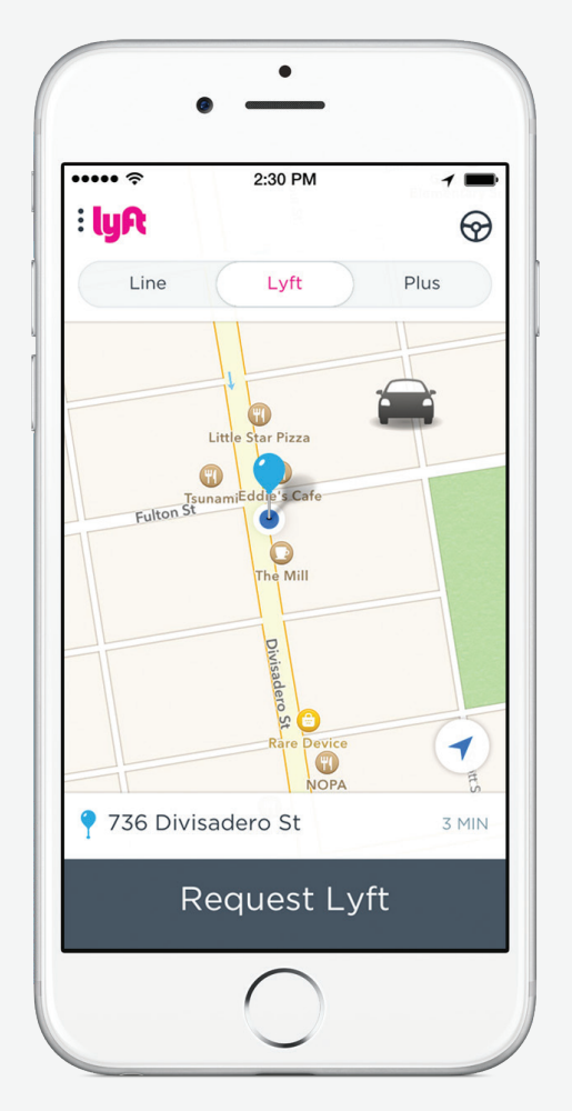
Download the Lyft app and request a ride with the tap of a button.

With Lyft Line, passengers can carpool together to make their trips even more efficient. Lyft launched in June 2012 and is in more than 65 cities across the country.