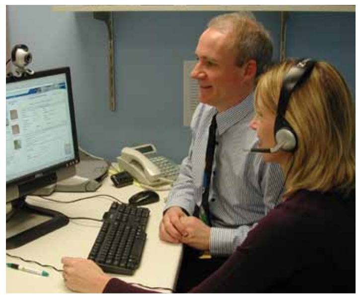
University of Rochester Medical Center

When an ill child arrives at school, a common response is for the school to call the parent or guardian to pick up their child. However, telehealth can help schools avoid sending children home, while appropriately protecting the health of both the affected child and the rest of the student population. Nearly 94 percent of parents surveyed in Rochester, New York's Health-e-Access child care program indicated that the problem managed by telehealth would otherwise have led to a doctor's office or emergency