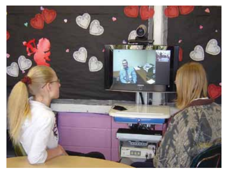
University of Arkansas for Medical Sciences